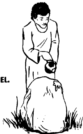
JACOB MADE A MEMORIAL AT BETHEL.

Nevertheless, Jacob suffered for his wrong doing. His daughter Dinah was disgraced. His sons turned into deceivers and murderers (34). Rachel, his beloved wife, died in giving birth (35:16-20). He lost Joseph, his first son by Rachel (37:34-35). He felt the disgrace of Judah, his fourth son (38) and He was separated from Benjamin, his youngest son (43).